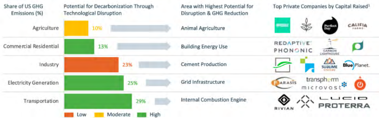
Silicon Valley Bank. (2021). Us GHG Emissions by Sector and Potential for Technological Disruption. The Future of Climate Tech.