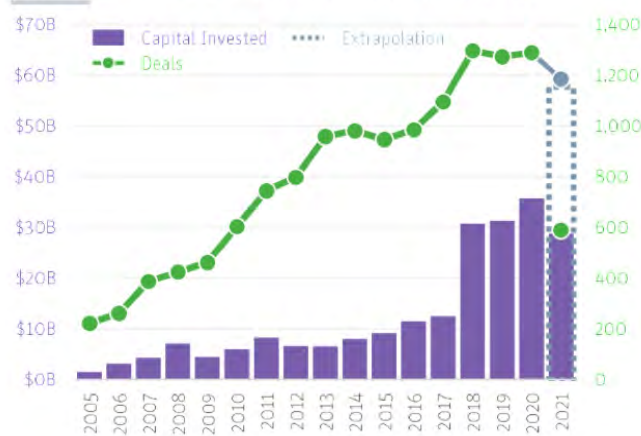
Climate Tech VC Investment Activity 1, 2

With our Climate Tech and Sustainability team, we are positioned to capture the climate opportunity. Our leadership role in the innovation economy and deep experience supporting evolving technologies enable us to contribute to the transition to a more equitable, net zero-emission economy. For more than 12 years, our recently renamed Climate Tech and Sustainability team and Project Finance team have been dedicated to supporting clients that develop solutions for a more sustainable world, monitoring emerging climate-driven technology and business models, collaborating with clients that innovate climate solutions, and developing innovative financing products and long-term relationships to support clients' growth. We currently have more than 500 clients in our portfolio and consider this market a significant opportunity driver for both our business and the public's access to innovation that tackles climate change.